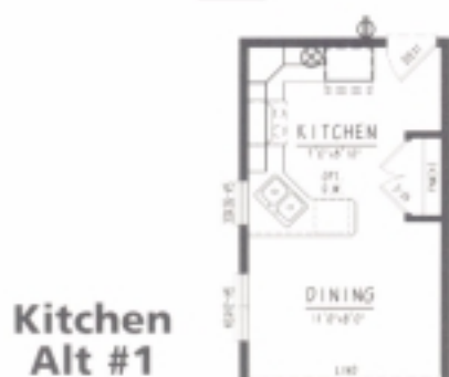
Kitchen Alt #1