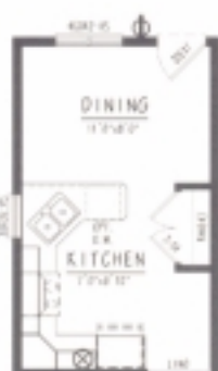
Kitchen Alt #2