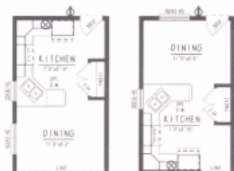
Kitchen Alt #1